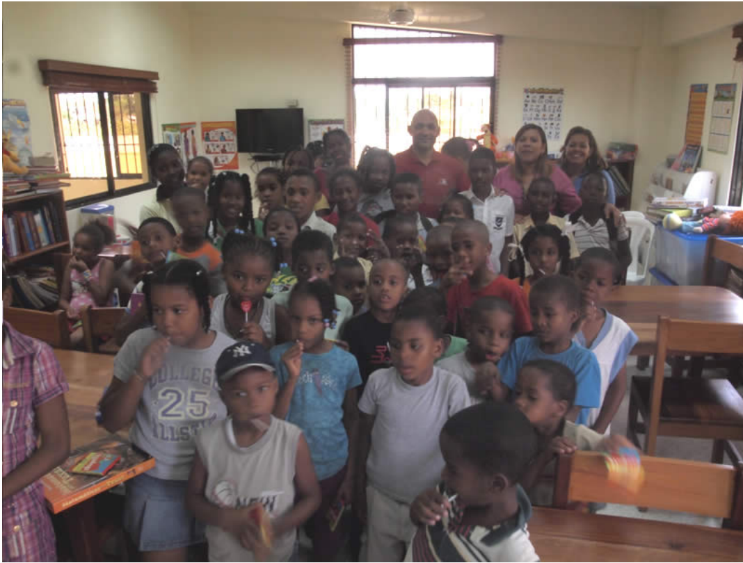
Reading is FUNdamental