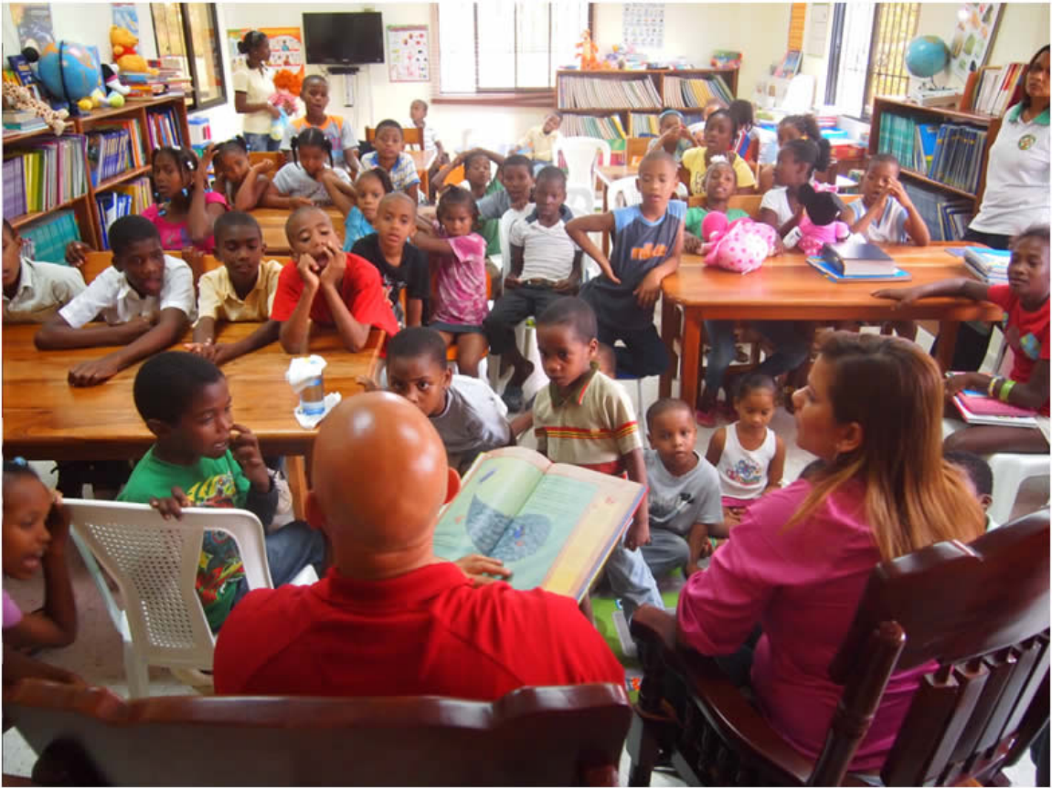
Working the audience