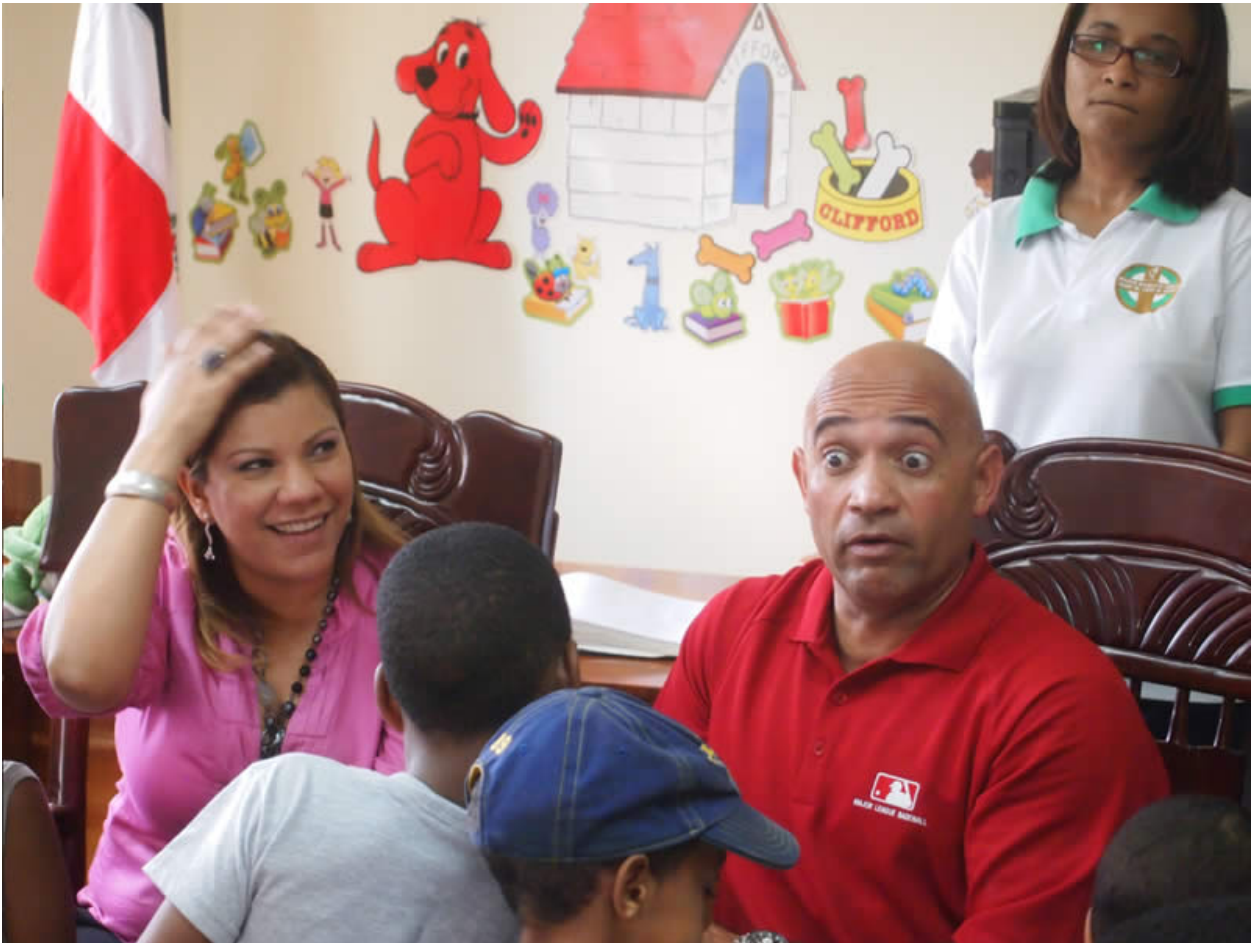
Getting into the moment