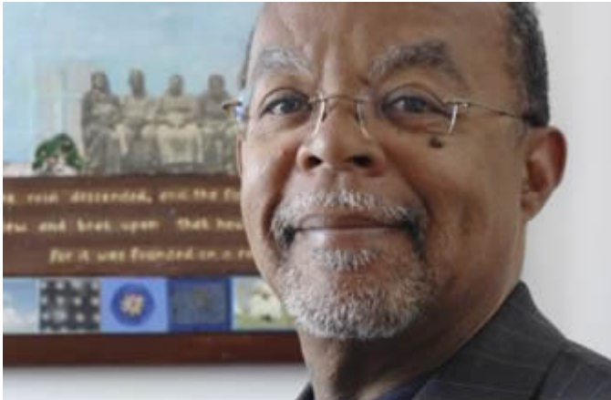
Henry Louis Gates Jr.