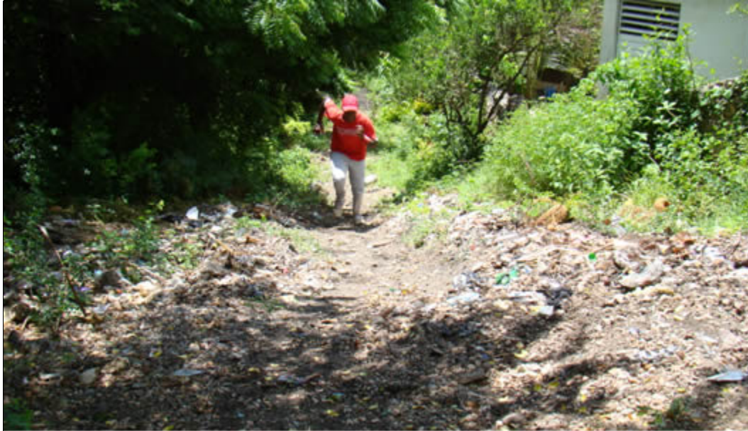
Running the hill