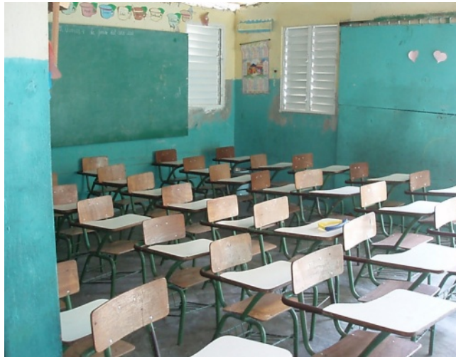
Classrooms will be standard equipment

The initiative was actually formulated and approved last fall and parts of the plan are expected to be put into effect soon, according to Sandy Alderson, the chief architect of the reform movement in the Dominican Republic, initially launched to address problems in Dominican baseball including age and identify fraud, steroids usage and money skimming. Alderson, now general manager of the New York Mets, said of the program, which will be mandatory for each team, “I think it provides an important starting point for improving educational opportunities for prospects, players and former players in the DR.”