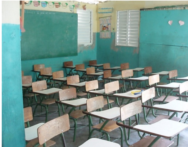
Salón de clases será equipo estándar